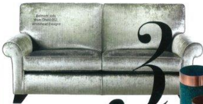
Beltment sofa, from Dhs2,052, Whitehead Design