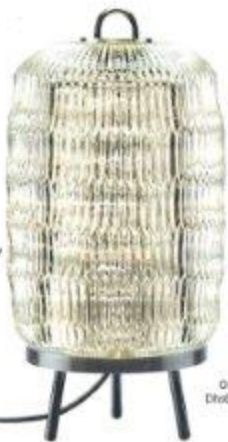
Outdoor light, Dhs6,395, Baccarat

In there no end to the talents of this Spaniard, but for unlike his modern architectural forms, this rug is soft, rich and wistful. Just what we love.