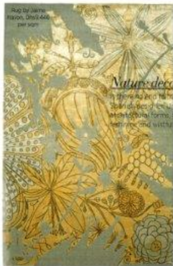
Rug by Janna Ravon, Dhs2,446 per sqm

Lex Potta's True Colour vases are pieces of design art that experiment with oxidation and the effects on colour and texture. Display and cherish.