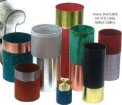
Vases, Dhs15,828 set of 8, Libby Sellers Gallery

Bring this handsome fellow into your world. The tactile silver fabric chimes perfectly with the trend for antique metals and is as comfortable and practical as it is pleasing to the eye.